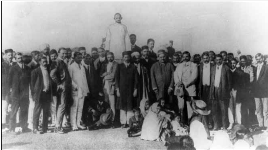
M.K. Gandhi at a farewell meeting held in Durban in 1914

institutions was bound to increase also on other, including cultural, planes. A visit by the Phoenix Settlement School to the Ohlange Industrial School was reported in Gandhi's journal some three weeks before his release from Pretoria prison. Exhibiting some familiarity with Ohlange, Gandhi's journal noted in its report of the visit: "The Ohlange School has already outgrown its fine two-storey building so that Standard III with its 37 pupils has to be taught in the old refectory. The carpenter shops, smithy and turning benches were also much admired." 51 A musical performance held at the Ohlange Industrial School was also appreciatively reported in Gandhi's journal in the following month. 52