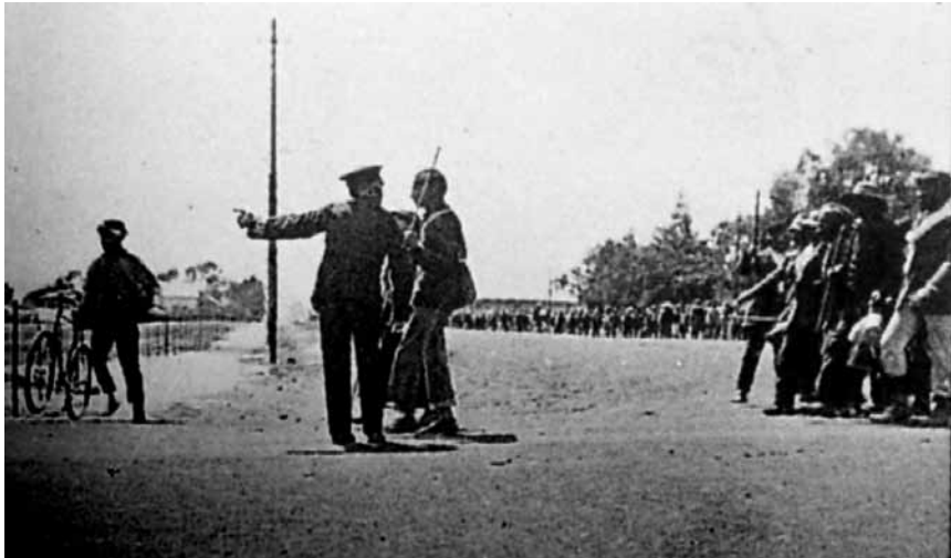
M.K. Gandhi leading a small group of striking Indian coal mine workers out of Newcastle on October 29, 1913, en route to the Transvaal border to defy the government's Restriction Act and to court arrest